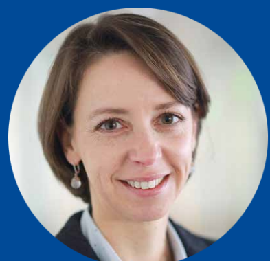
CHRISTELLE DEFAYE GENESTE Chairwoman, European Union Affairs Committee